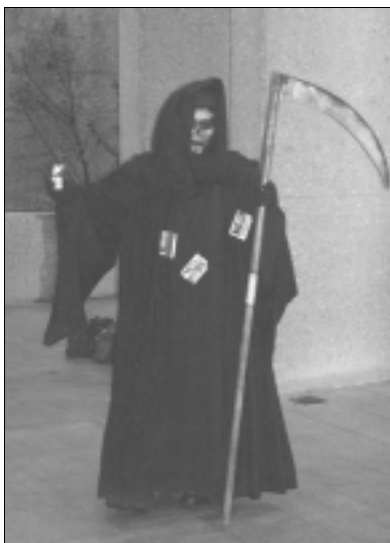
Yesterday the Grim Reaper took INB5 delegates by surprise as they entered the CIGG.